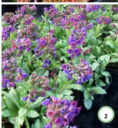
Pulmonaria 'Diana Clare' (2) – so how many lungwort varieties are out there?! However, not all are created equal. This is a brilliant foliage plant mixing all silver with spotting. Two-