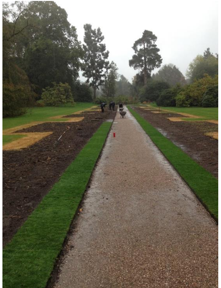
“the ‘footprint’ of the new borders”