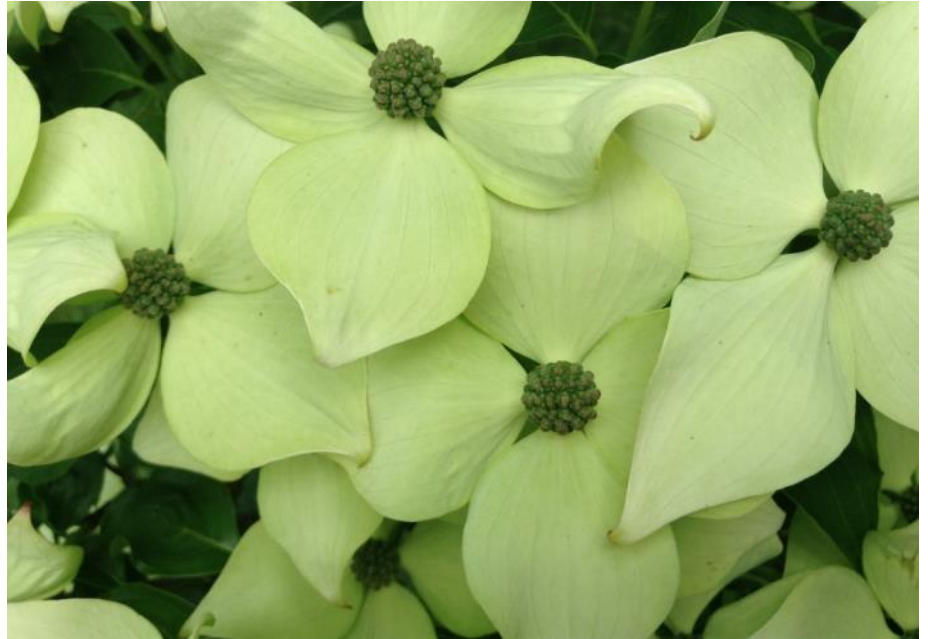
“On the south facing slope flowering dogwood (Cornus) have been added”

As I write this in February there is nothing to see but we hope that when you visit you can begin to see the new planting taking shape!