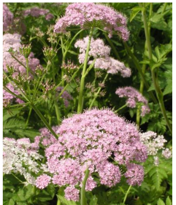
" Pimpinella major 'Rosea' – a charming and classy umbel"