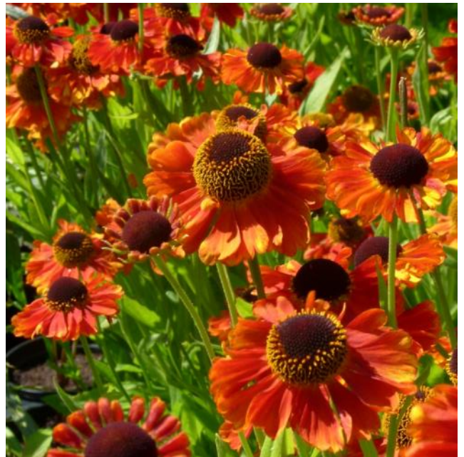
“Mardi Gras: a festival of flower”

Here's my favourite Seven Dwarf heleniums; there's certainly Happy here but I've yet to find a Bashful one. If you keep them well watered, they won't be Grumpy . Don't be Dopey and over-feed them and remember in the winter they'll be Sleepy so cut