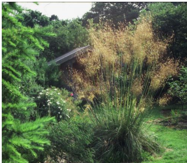
" Stipa gigantea is often called Giant Oat Grass: it stands 5 to 6ft high in flower."

Christine Ffoulkes Jones runs Hall Farm Nursery with husband Nic and is a well-known garden speaker and show judge.