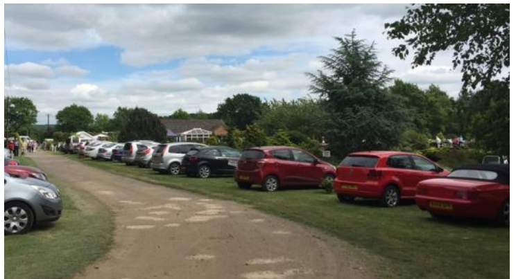
“Thirty minutes after opening 350 visitors had arrived .”