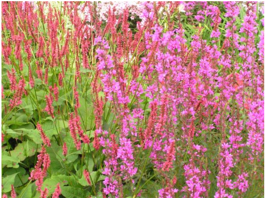
“... a clump of Persicaria amplexicaulis and lythrum”

Mandy is a very experienced nurserywoman and keen plantswoman. She runs Mandsand Plants and gardens in the north of Cheshire.