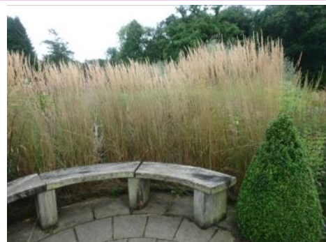
“ Calamagrostis x acutiflora ‘Karl Foerster’ is a great accent plant.”