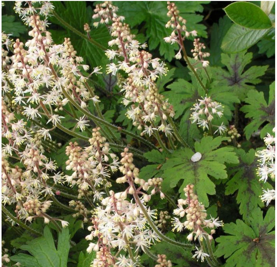
“Don't forget heucheras, heucherellas and tiarellas”