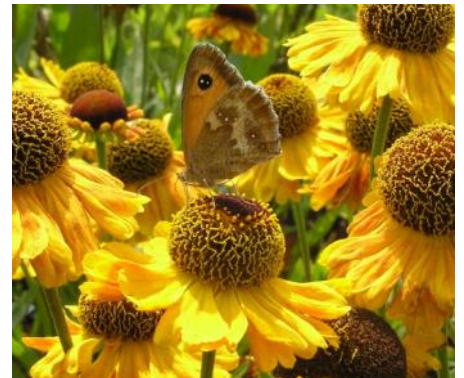
"Carmen is a new variety"