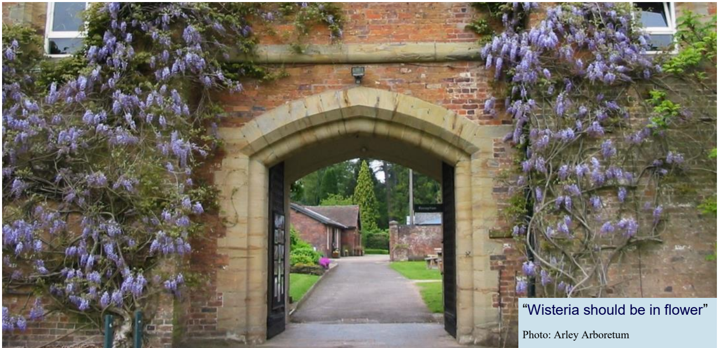
“Wisteria should be in flower”