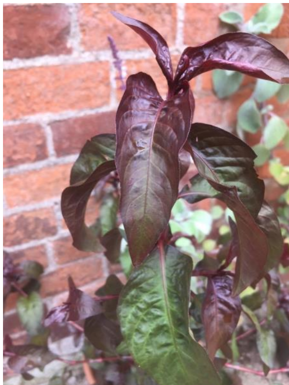
“ Persicaria hydropiper var. rubra is from Japan, where it is known as Azebu-tade, we know it as Red Hot Water Pepper”.