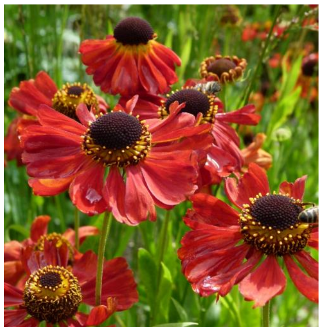
“Red Army, the best of the reds”