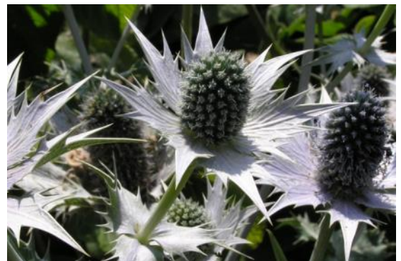
" Eryngium giganteum is a very architectural, self-seeding biennial,"