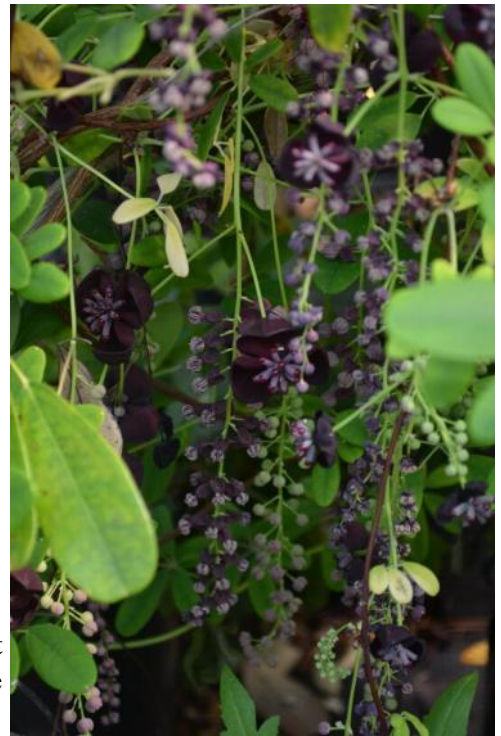
“ Akebia longiracemosa has long racemes of flowers and is a neat evergreen”.

The star for me is however the more recent introduction of Akebia longiracemosa as its name implies much longer racemes of flowers and is a neat evergreen. Akebia quinata comes from that area of China and Korea where the two countries join, this is a very cold place in winter and its no surprise to find that Akebia quinta is very hardy, however they have short springs in that part of the world while in the UK climate the poor plant is often fooled into flowering as early as February, some while before the danger of frosts is past, with the result that flowers can be frosted off. For reliable flowering a wall is therefore recommended in cold parts, the good news being that it can be a north facing wall as Akebia will flower just as well there as anywhere else. Often billed as evergreens Akebia will change their leaves as the flowering starts, which actually improves the display as flowers are then more visible and the new foliage is fresh and green. Books will tell you Akebia will also fruit but it is rare with just one plant to get pollination in this country despite both male and female flowers being present, the fruit however is rather eye catching (and edible) so its worth doing a bit of hand pollinating. These climbers are all good garden plants and flower all the way down to the ground.