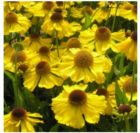
"Gelbe Waltraut is pure yellow"