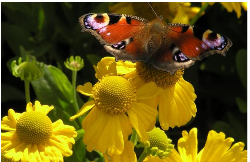
"Pumilum Magnificum from 1896"