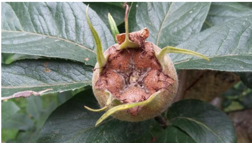
“Medlar is known as ‘cul de chien’ in France: ‘Dog’s Backside’”

E-mail: dlhmanorhouse@leics.gov.uk Phone: 01455 290429 website: www.doningtonleheath.com