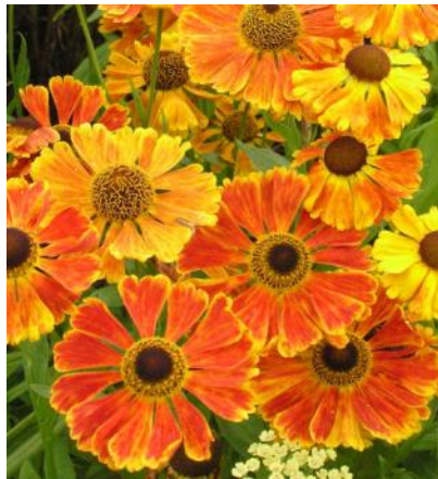
"Waltraut has large flowers"