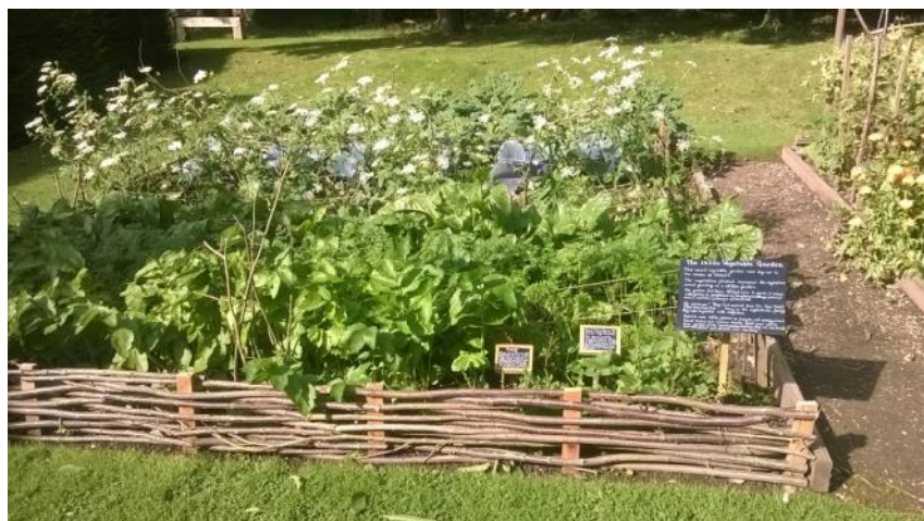
“The vegetable garden has crops that could have been found growing in the 1620s”

The root bed includes a leaf crop called Good King Henry (probably named after Henry V of France). This is known as Poor Man’s Asparagus, Perennial Goosefoot and Lincolnshire Spinach—take your pick!