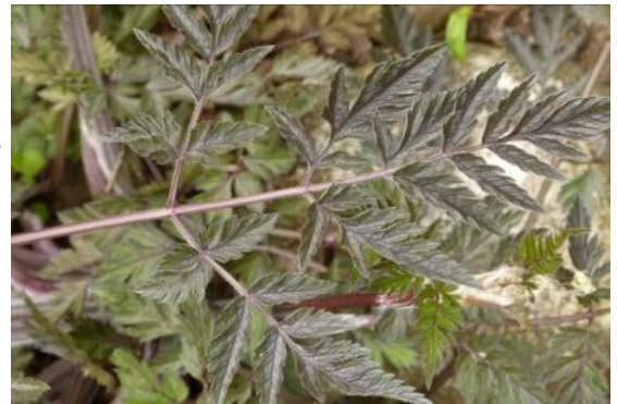
"'Ravenswing' is a handsome dark leaved form of anthriscus"

Bupleurum longifolium – a lovely and unusual perennial with copper / bronze 'flowers' (actually petal-like bracts), which are long-lasting. The seed heads are almost as decorative. Bupleurum fruticosum – unusual in that it is a shrubby umbel, has grey-green foliage topped by acid-yellow flowerheads. It is irresistible to flies, which are excellent pollinators. Originating from southern Europe, it is said to need a sheltered spot,