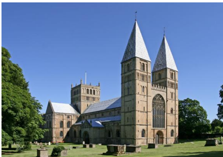
Photo: Southwell Minster

Refreshments available throughout the event.