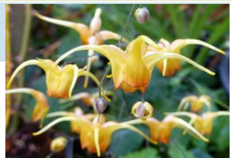
Epimedium Amber Queen