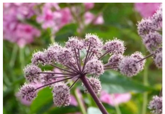
"'Angelica 'Vicar's Mead' has dark maroon foliage and branching stems terminating in dusky pink flowers"