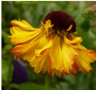
"Fata Morgana like a mirage"