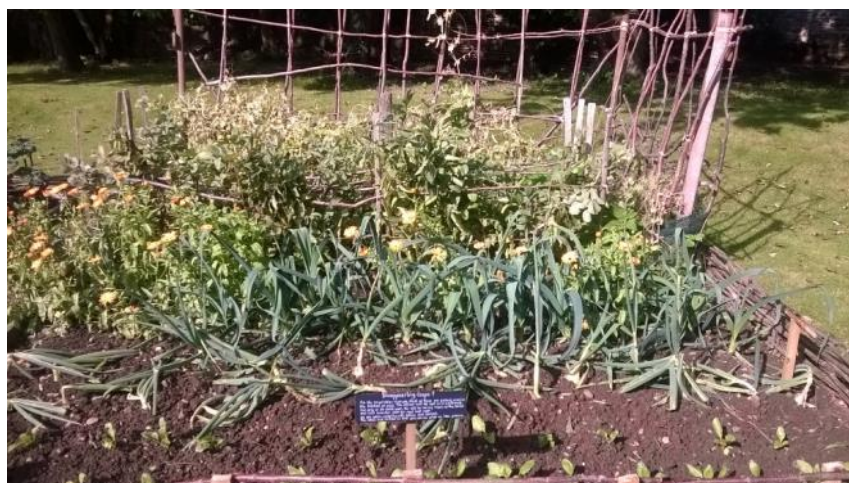
“The onion bed includes leeks and garlic”