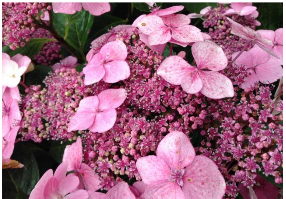
“On the opposite side hydrangeas have been planted for a massed effect in spring and summer”