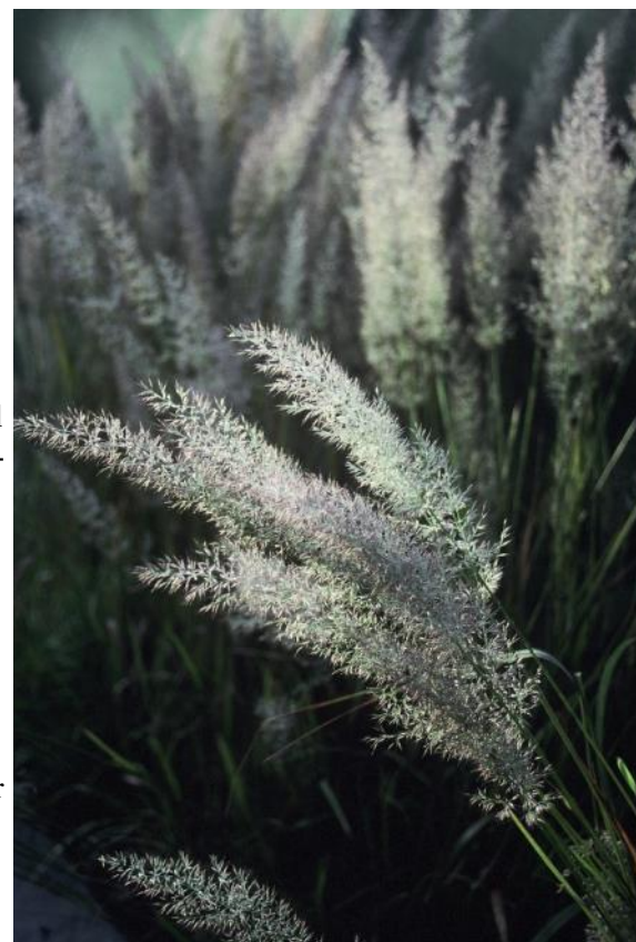
“ Calamagrostis brachytricha is known as Korean Feather Grass.”