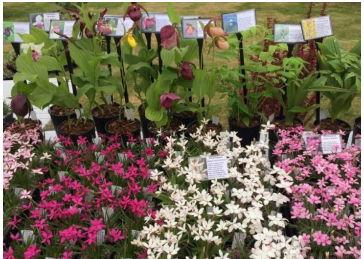
“Excellent plants from Edrom who left home in Berwickshire at 1:30am.”

Overall, we had a very successful day. Just over 1,000 visitors raised £3,000 for NGS charities. All nurseries reported healthy business. Visitors to the refreshments tent had consumed 46 very large cakes and every-time I meet someone who visited, they congratulate us on giving them a unique and most enjoyable day.