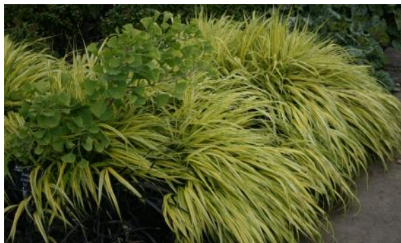
“ Hakonechloa macroa ‘Aureola’ is happy in at least partial shade.”

At 2 is the subtle beauty of Panicum virgatum ‘Squaw’. As the name suggests it is a native of the North American Prairies. Forming strong clumps 4 to 5ft high, with dainty airy panicles of flowers in late summer and autumn. These flowers seem to reflect the colours of surrounding plants, whether it is the powdery blue of Aster ‘Little Carlow’, striking yellow of Rudbeckia fulgida var. deamii ’ or strong mauve of Verbena bonariensis – all of which associate perfectly with this grass.