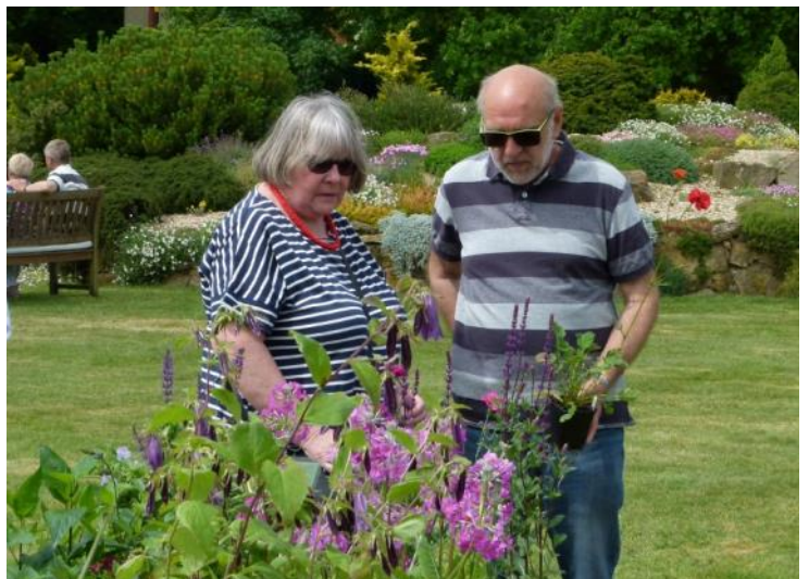
“The garden and plants looked amazing and people flocked into the fair.”