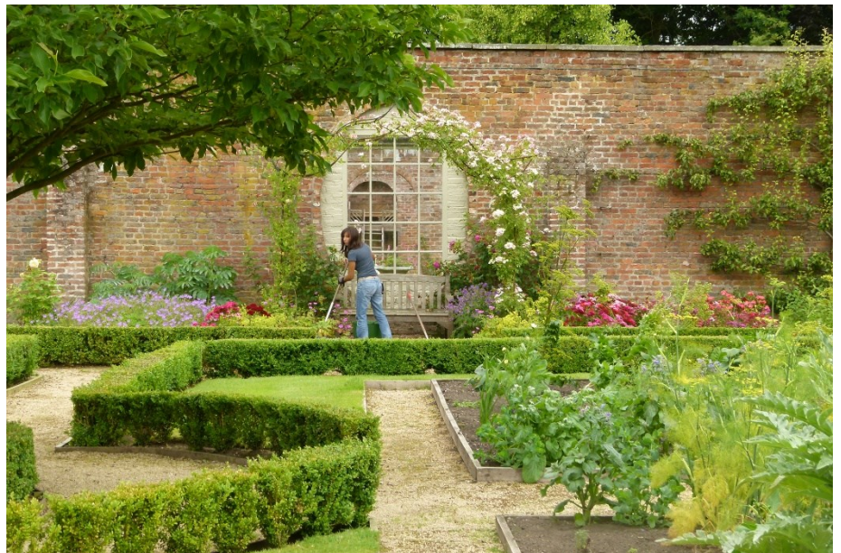
The old Walled Garden has been completely transformed