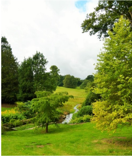
The gardens nestle in the undulating Cheshire landscape

Nestling in its Cheshire landscape and surrounding two magnificent lakes, the gardens contain many fine trees and shrubs including some rare specimens of Rhododendrons, Camellias, and Magnolia.