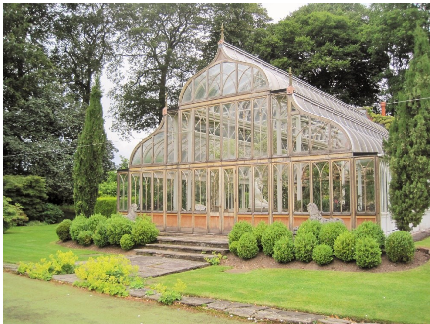
Glazed pool house by Francis Machin

The glasshouses are home to the exotic collections as well as more homely plants.