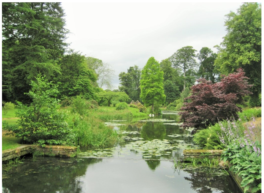
The garden surrounds two lakes