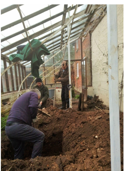
"The traditional method (which we adopted) is to plant figs in a box that contains the roots"