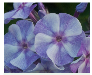
Sternhimmel (Starry Sky)