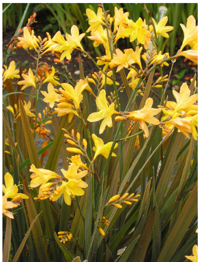
The yellow-flowered “Solfaterre “ also has bronzed leaves.