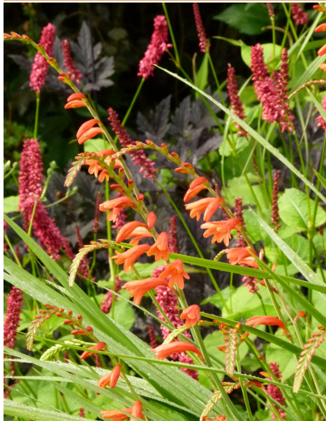
C.pottsii "Tall Form" is set off by dark red Persicaria "Dicke Floskes" and bronze leaves of Actaea atropurpurea