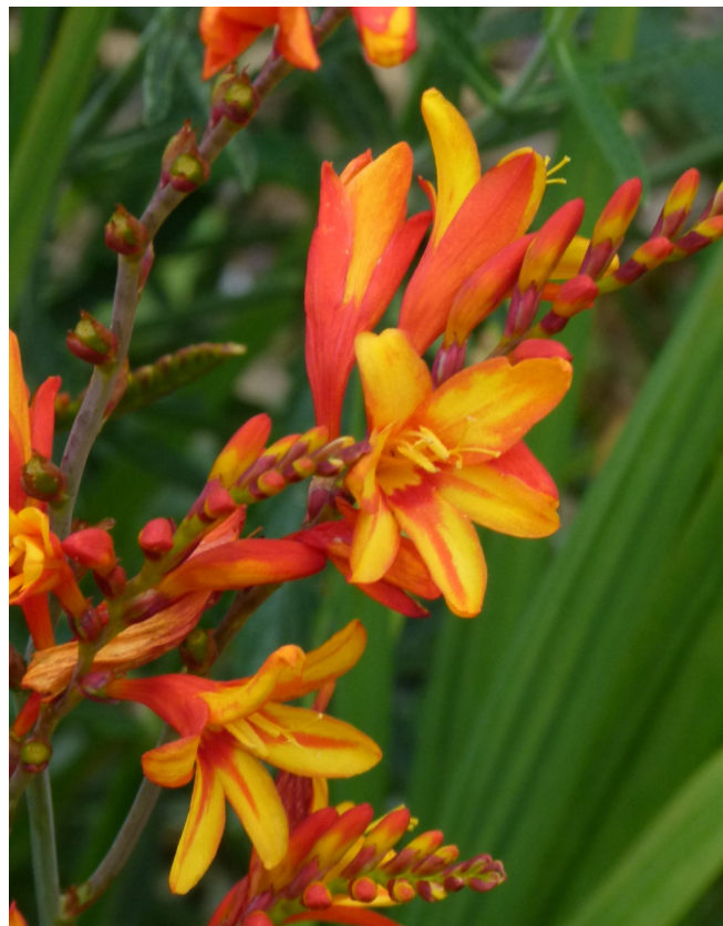
Firejumper” a short variety for the front of the border .

Once the shoots show through in spring keep the plants on the moist side. If a late, hard frost is forecast after the shoots are showing, I cover with garden fleece or a mulch, although established clumps will recover quickly from any frost burn.