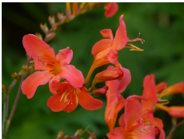
"Limpopo" is one of the pinkish-coloured varieties.