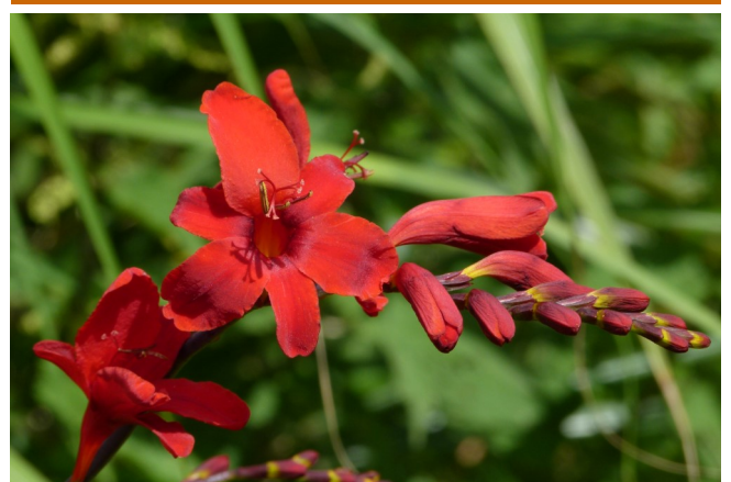
"Hellfire" is a little shorter and later to flower than "Lucifer" and has luscious, deep, velvety red flowers