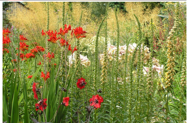
"Lucifer" amongst regal lilies, rusty foxgloves and giant oats.

By choosing different varieties you can have flowers from July to early October and plants from 1ft / 30cm to 4ft / 120cm tall.