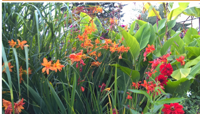
Crocosmias blend splendidly with exotics like cannas and brightly coloured dahlias.